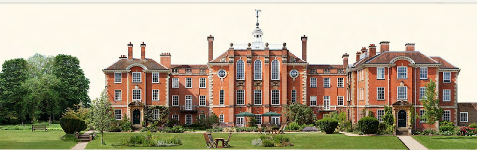
Lady Margaret Hall - Oxford